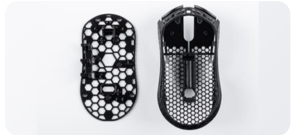
High accuracy printing with customized surface finishes.