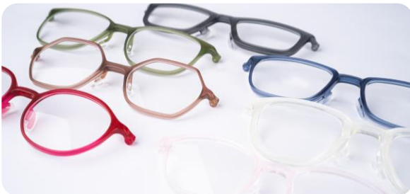
Print TM 79 in a wide range of colors and opacity.